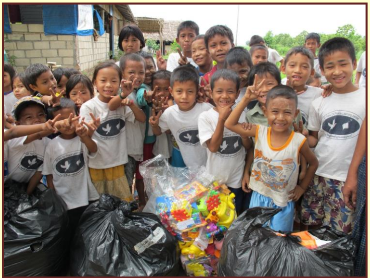
Children at migrant schools receiving donations