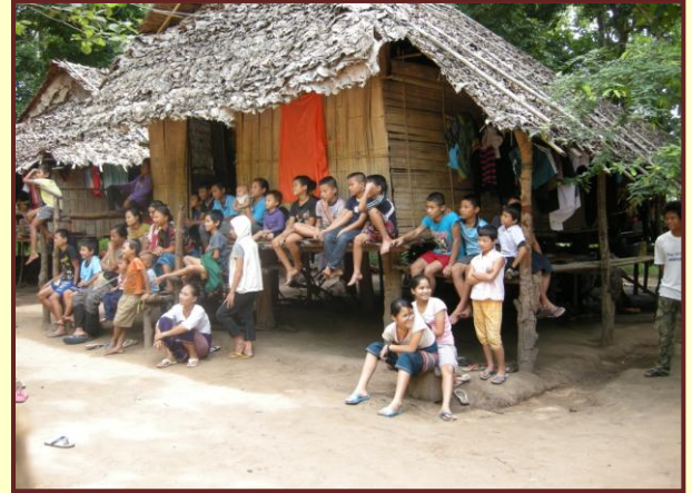
Noh Bo Deh School with 'Clown TukTuk' and show at forest location