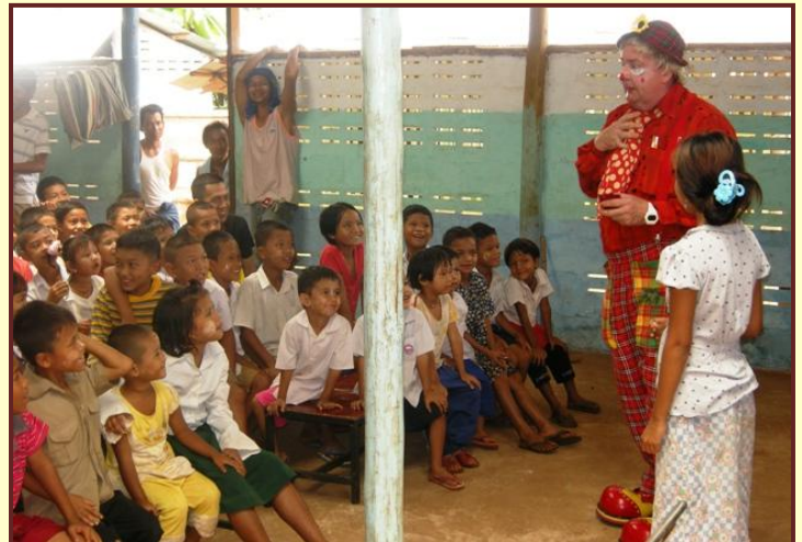
Last clown show for the children and teacher at KGA migrant school on the road North to Umpang Thailand