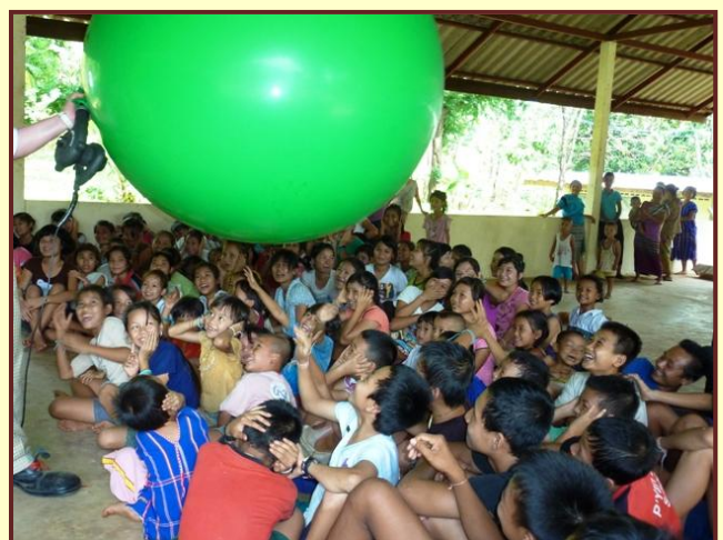
Pa Yan Daw School with 'Clown TukTuk' and show in temple meeting hall

7.30pm. We held production meetings with the TV crew and decided the best way to organise the next days filming of a show for the children who live on the garbage dump near Mae Sot.