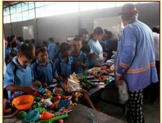
Donations of toys and clothing for the children and teachers of Sky Blue School