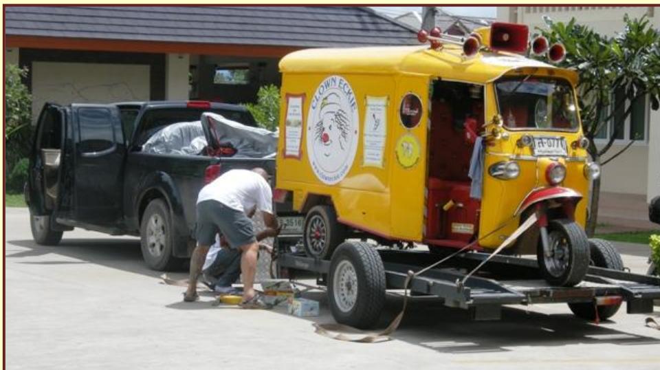
Loading the only Clown TukTuk in the world onto trailer (TukTuk is the name of these three wheeled vehicles in Thailand)