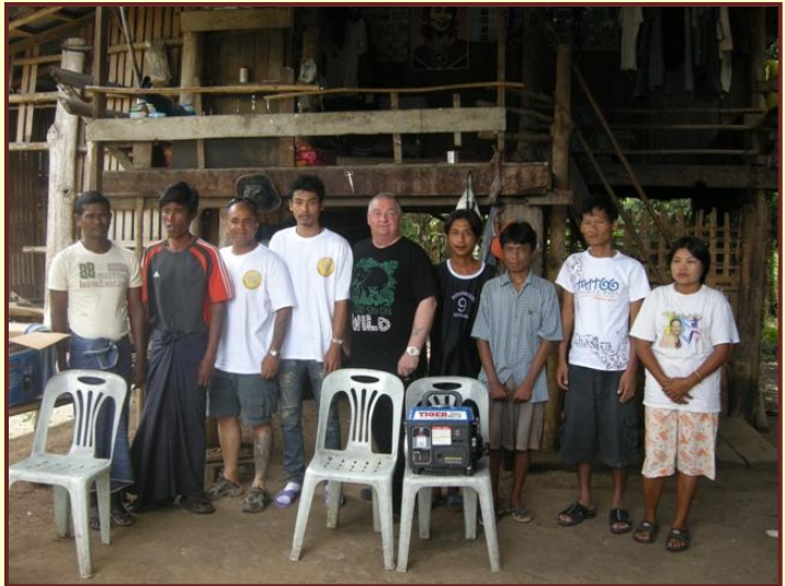
Some of the men and volunteers during the hand-over of a new generator