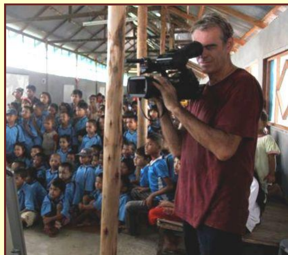
'Co Jo Productions' Camera-man for Al Jazeera News