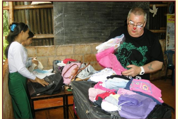
Clown make-up and show then Donations of school bags and clothing for the children of Best Friend School