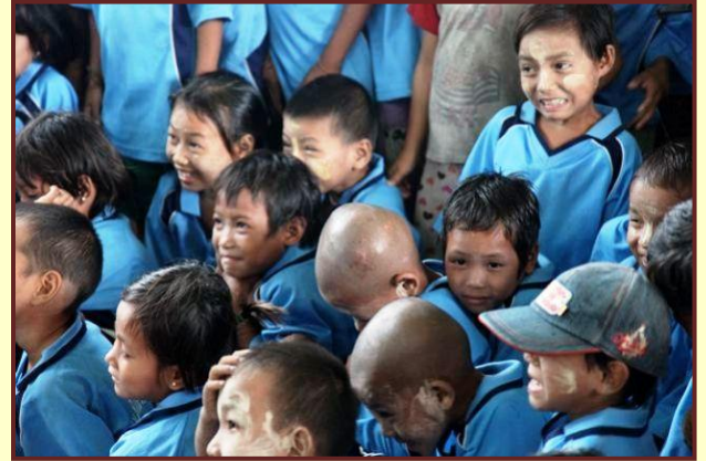
Sky Blue School with 'Clown TukTuk' and show in new school room